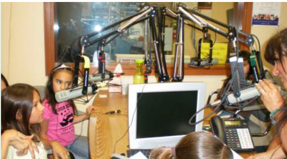
Children participating in El Jardín de los Niños show in KDNA's studio.

Besides being entertaining, El Jardín de los Niños provides education and information to enhance child development. By focusing on child development, parents can be assured that their children will receive the necessary preparation to lead rewarding adult lives. The program's target audience is children of farmworkers as well as young parents and grandparents. In addition to farmworker families, the show reaches other low-income individuals, as well as children who may not be bilingual but want to learn Spanish. The program covers topics like child abuse, pesticide exposure to children, gang and drug prevention, and the importance of education. El Jardín de los Niños strives to inform and educate children at an early age in order to help guide them through life's challenges.