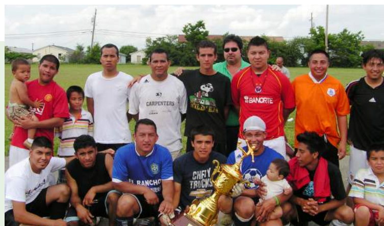
The winning team of the tournament with their children.

Through a partnership with The Hope Center, on-site rapid HIV testing was available in a private, mobile testing unit. Booths for health topics were set up in a public park pavilion; healthy snacks and water bottles were distributed. The HIV booth offered prevention education and brown bags with condoms and sexual-health information.