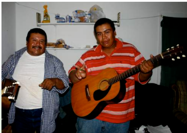
Two farmworkers playing music as a form of alternative therapy.