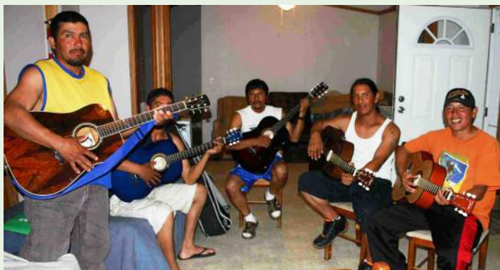
Farmworkers participating in a music therapy session at their camp near Boone, NC.

The curriculum, designed in 2008 by a graduate student in counseling to be implemented by community health workers, includes group activities, as well as open-ended and directed conversation among the male workers on the emotional difficulties of migration. As part of the project, the workers used disposable cameras to document their daily lives, with the understanding that the photos would be used for discussions, art activities, or for sharing their experiences with family in Mexico. The initial response by workers has been positive and the curriculum is now available to other outreach sites in the state.