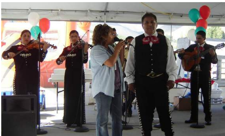
A Columbia Valley Community Health promotora sings at a migrant health fair with help from a Mariachi group.

Each year, HOP disseminates a call for submissions of innovative outreach practices to health outreach programs nationwide. The call for submissions is publicized through mailings, HOP's website, migrant health listservs, at Migrant Stream Forums, and by word-of-mouth.