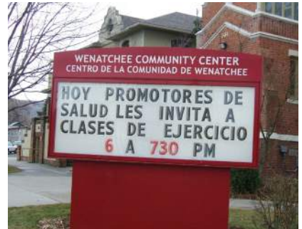
An invitation to participate in Columbia Valley Community Health's free exercise classes for women.

The innovative outreach practices featured in this report are presented in two sections, Special Feature: Practices Addressing Behavioral Health and Innovative Outreach Practices At-Large . The behavioral health section begins with an introduction, delineating why HOP decided to place a special emphasis on the topic in this year's report, followed by four innovative outreach practices in behavioral health service delivery. The Innovative Outreach Practices At-Large section includes 13 practices on a range of topics, many of which were nominees for the Sister Cecilia B. Abhold Award . Recipients of the award for 2009-10 are featured on pages 6-7.