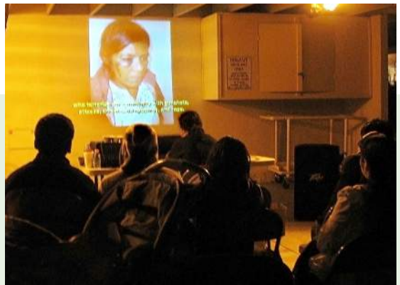
Families watch horrific actions in a documentary about the Teacher's Strike in Oaxaca.

This is an important opportunity for many farmworkers as little to no culturally-competent assistance or mental health services are available to these farmworker communities. Cine Comunitario can be used as a tool for education and outreach while offering a way to connect. This practice relays the message that there are professionals that understand culture shock, respect traditions, and want to help improve the emotional health and wellness of the farmworkers in the community.