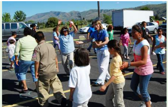
Migrant health fair, Fruit and Vegetable Walk.

The presentations teach how media influences behavior, how to deconstruct media marketing directed at Latinos, and provide take-aways on topics such as activism and counter ads. Teaching points are shared with participants so they can give the presentation themselves. The Together! program has raised tobacco awareness among the most vulnerable population in CVCH's community, those who have the least health access when tobacco-related illness develop.