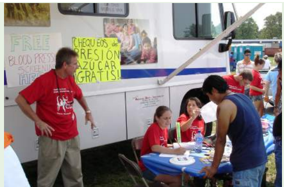
Outreach Specialist providing health screenings to farmworkers with the Mobile Van.

Once in the center, SJFMC administered the rapid Influenza A test and some positive cases were identified. SJFMC also worked closely with all county health departments and called upon programs like the National Center for Farmworker Health's Call for Health to obtain prescriptions for farmworkers if needed. In addition, SJFMC developed an educational hotline for those with questions, developed an over-the-phone triage for anyone who called into the health center with flu-like symptoms, and directed those with flu-like symptoms to a special entrance that allowed for speedy walk-in service.