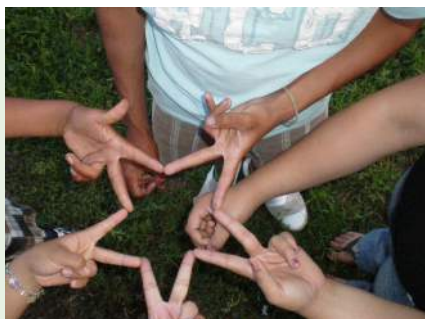
Teen Health Aides engaging in team-building activities.

The Infórmate program is unique in that it adapts the promotor(a) or model of health education and outreach and applies it to teens and young adults. The program provides them with economic and social support and gives them confidence to go out into their community and become active peer educators and health advocates. To engage their peers and community, Teen Health Aides employ any number of methods, such as performing skits for their peers on health-related topics that accurately portray teen health issues, along with messages about prevention and well-being. They also produce fotonovelas , or comic strips, that communicate easy-to-understand health education messages through pictures with dialogue captions. Both the program and methods were developed to be culturally competent and age appropriate in order to reach farmworker adolescents and young adults.