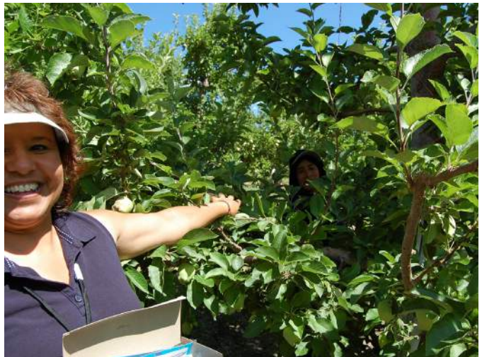
Columbia Valley Community Health's outreach worker bringing toothbrushes to the orchard.

Also featured in this report is a program in North Carolina which used focus group data collected from local farmworkers to implement three creative and culturally-responsive initiatives addressing the behavioral health needs of the farmworkers they serve. Through the use of farmworker feedback, this program is able to offer services that engage and empower farmworkers in addressing their mental health and wellness. These practices are just a sample of the 17 practices showcased in this report. We believe that you will find several that can be adapted to help tackle issues you face in your community.