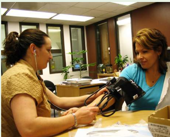
Staff doing a blood pressure check.

Now MHSI's electronic health records and practice management system, which handles day-to-day medical operations, allow all information to be available at the fingertips of outreach workers and clinicians. The latest registration updates, alerts, and demographics are available in real time, regardless of where the patient was registered. The same holds true for medical information, such as patient lab results, medical problems, medication lists, and when the patient is due for screenings. The electronic health record system also alerts providers to possible drug interactions, serving as an additional safety measure. As patients leave MHSI's service area for their home base, they are given a print out of their chart summary to give to their home-base providers for continuity of care.