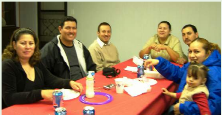
Focus group for clients in Washington County in North Central Kansas.

KSFHP staff utilize special protocols for pregnant clients and clients with diabetes, matching them with a case manager who speaks their language and provides support while they are in Kansas. Due to a lack of health information available in Low German, KSFHP staff also developed Harvest of Health , an audiovisual health book available in all three languages that addresses topics such as nutrition, depression, alcoholism, smoking, family planning, immigration, preventative services, and farm safety. Additionally, an annual health promotion calendar is designed using words and pictures to encourage healthy choices. These services, combined with statewide networking and strong collaboration with local health care providers, have resulted in positive changes in health care received and healthy choices made by the Mennonite population.