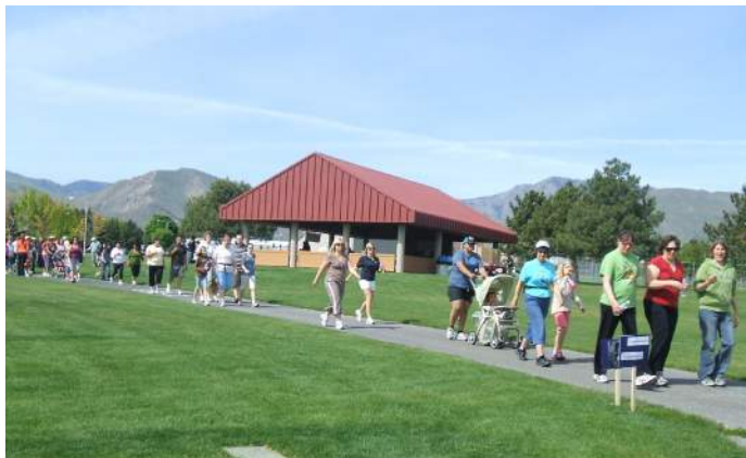
Two communities of women join in a 3 mile health walk organized by Columbia Valley Community Health.

Although every outreach program is unique, the practices highlighted in this report can be adapted to meet the specific needs of your organization. Another key feature of the report is the collection of brief implementation tips (indicated with a lightbulb) that suggest how practices can be adapted or point out additional resources. Please contact HOP if you would like more detail or guidance to effectively implement or adapt featured practices.