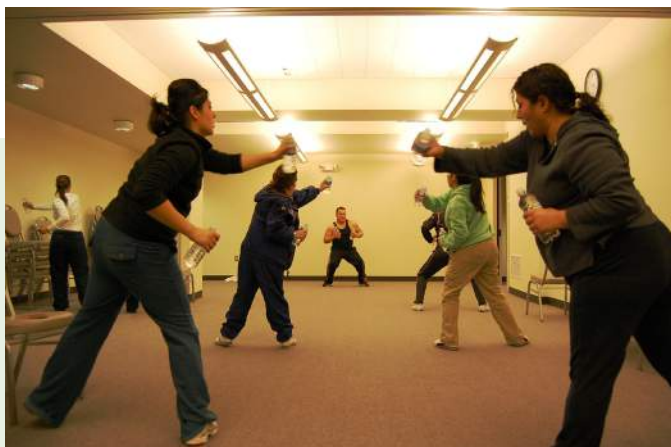
Participants using water bottles as weights in the women's exercise class.

Classes range from 15-30 participants and occur off-site in a local community center. One community partner for this project is the YMCA, which offers free 6-month memberships to participants completing the exercise course. Those who want to continue their membership after six months are encouraged to apply for a scholarship. Generally the last class in the series is held at the YMCA in order to familiarize participants with the facilities and reduce their fear of the unknown. While some participants continue to attend each series of classes, many transition into a physical activity routine at the YMCA after having learned why and how to exercise.