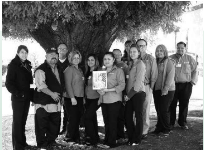
Avenal staff (pictured above) provided Sunday clinic services to male farmworkers.

At the end of the visit, patients were given a lunch bag also filled with information on diabetes, asthma, pesticides, and dental care. Water bottles were given as incentives for completing the exit survey; according to the resulting feedback, all 28 patients liked the price of the services, how they were treated, the attention they received, and that all services were received in one day. Most importantly, they felt comfortable and said they would visit the clinic again. Staff working that day felt satisfied; the atmosphere was great, and everyone worked as a unified team.