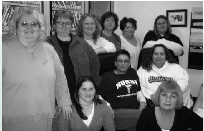
Members of the Assertive Community Outreach Team (shown above) provide clinical outreach, case management, and counseling services to homeless clients in Southeast Kentucky.

Every team member takes an active roll in the persistent monitoring and treatment of all clients served by the program. Because each staff member is kept updated about all clients served by the program, staff are quite comfortable rotating shifts and sharing caseloads. This collaborative environment also helps decrease the chances of burnout and exhaustion among the outreach staff. In addition, these meetings can be somewhat therapeutic releases for the hardworking members of the Assertive Community Outreach Team. They are consistently taxed with trying and sad situations from their homeless patients, so these daily meetings enable team members to openly discuss any feelings or ask for colleague support.