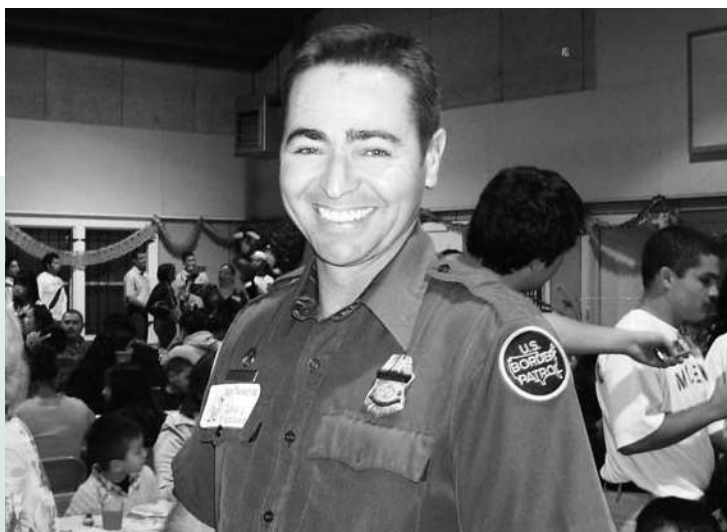
One of the Border Patrol volunteers at Casa Familiar's annual "American Traditional Thanksgiving Dinner."

One of the most successful demonstrations of this collaboration is at Casa Familiar's annual "American Traditional Thanksgiving Dinner" that hosts over 1,000 community members of all ages in a family dinner setting, with Border Patrol agents volunteering as the official servers of the meal. This event is a testament to the community's ability to break down barriers, build bridges, establish trust, and forge relationships among unlikely partners.