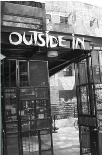
The entrance to Outside In, an agency dedicated to reaching out to homeless youth in the Portland area through the Road Warrior Access Project.

The Road Warrior Access Project operates on a drop-in basis Mondays from 10:00 PM to midnight because homeless youth are reluctant to seek health and social services during regular clinic hours, especially if they are contending with substance abuse, severe mental health issues, or experiencing discrimination based on sexual orientation. Since the project maintains a consistent schedule with set hours, youth can depend on the program and seek out health services when they are needed.