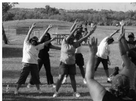
Members of the Community Leaders Group participate in exercise program sponsored by Clínicas de Salud del Pueblo.

FHSI's goal is to promote effective outreach approaches among any and all organizations serving farmworkers. In addition to gathering ideas from this report, reflect on what makes your outreach program innovative and share your unique approaches, projects, and ideas with your outreach peers. You can submit your success stories for future editions of this report through a simple form on our website.