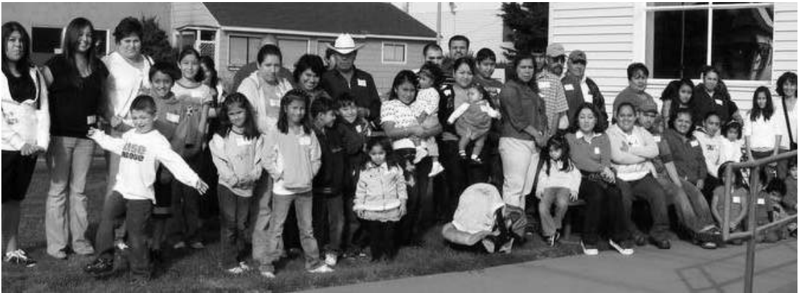
Día de la Familia , or Hispanic Family Day, participants gathered outside of the Plaza Comunitaria for a panoramic picture.