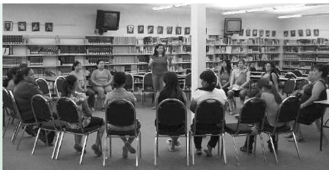
A Clínicas de Salud del Pueblo staff member leads a discussion about teen pregnancy with local parents as part of the Hablando Claro program.

Clínicas credits the success of the program to, 1) the involvement of a Community Leaders Group or advisory council, comprised of teens, local adults, and promotoras ,