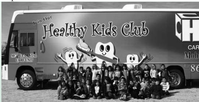
Local children gather for a picture in front of Community Health Centers of Lubbock's mobile health unit.

As part of their ongoing duties, CHCL staff routinely educate landlords, property owners, and community partners about the services offered by the MHU. Often, CHCL provides background information on farmworkers themselves, as many landlords are unaware of the true farmworker experience and have minimal contact with these tenants. CHCL staff advocates on behalf of farmworkers by elevating the importance of their contributions to the local and state economy. The landlords and