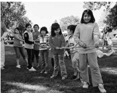
Kids playing a game of tug of war at Del Norte's Binational Health Fair.

Nominations for the award are based on the submission of innovative outreach practices by 330(g)-funded organizations. The recipient of the award in each stream is announced and presented with the award before their peers annually at the corresponding Migrant Stream Forum.