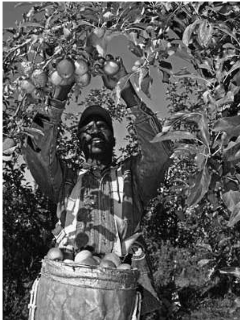
An apple picker at work.

Maine Migrant Health Program Clínicas de Salud del Pueblo Avenal Community Health Center Cherry Street Health Services