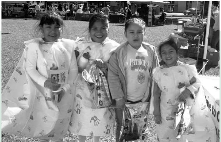
Local children wear the free lab coats given away as part of the “Children’s Doctor Dress-Up” booth at the Yuba-Sutter Binational Family Health Fair.

Families are encouraged to participate in a family-fun walk in addition to the music, ethnic foods, raffle prizes, and other entertainment offered throughout the day in order to insure a successful outreach event. Over 30 agencies typically collaborate on the event and participants are encouraged to take home the event passport flyer that includes the phone numbers of agency booths. The goal of the event is to educate attendees about the importance of the prevention and treatment of illnesses. In just two years, the fair has become the premier health fair and the most successful innovative outreach tool within the greater Yuba and Sutter County Area.