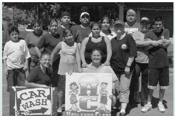
Members of the Community Leaders Group Advisory Council participate in a fundraiser organized to support council activities.

Including teens in the Community Leaders Group was one of the original and innovative components Clínicas added to their Hablando Claro Pregnancy Awareness Program. The idea stemmed from Clínicas' commitment to full-community participation in the design, implementation, and evaluation of the program. Though the program targets adults, Clínicas felt teens needed to be part of the Community Leaders Group to keep the program focused on the needs of teens and provide input about how teens can better understand their message. To date, one-fifth of the people reached by Hablando Claro have been under 20 years old, which would not have been possible without the influence of the Community Leaders Group.