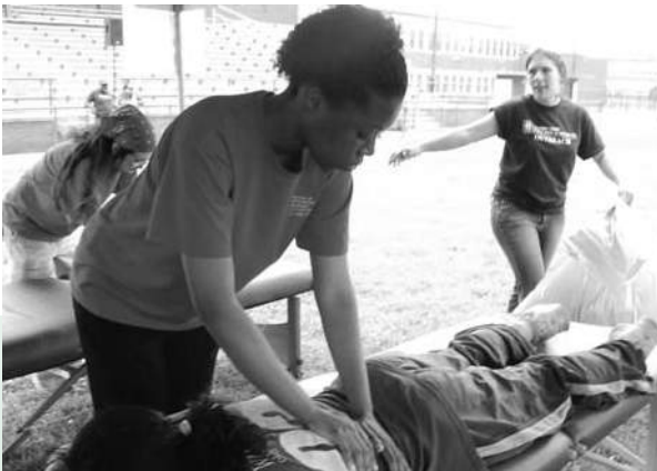
Volunteer osteopathic medical students from the University of Medicine and Dentistry of New Jersey work with participants at the Back Pain Clinic at the 2008 Farmworker Festival in Penns Grove, NJ.

Since some farmworkers were timid to come up and request services from the mobile van, it seemed logical to merge it with the Back Pain Clinic. This has proven very successful, as farmworkers come to receive services from the Back Pain Clinic and are then referred to the mobile van for medical treatment.