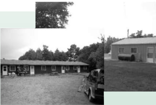
Sample pictures used in the Cherry Street camp profile portable field tool.

The outreach team began by combining readily-available logistical information from internet sources with digital photographs and valuable field information in order to generate a field guide for farmworker outreach activities that will be available for years to come. Resources used include Google Maps and the Michigan Department of Agriculture website, which has a listing by county of all registered migrant labor camps in Michigan.