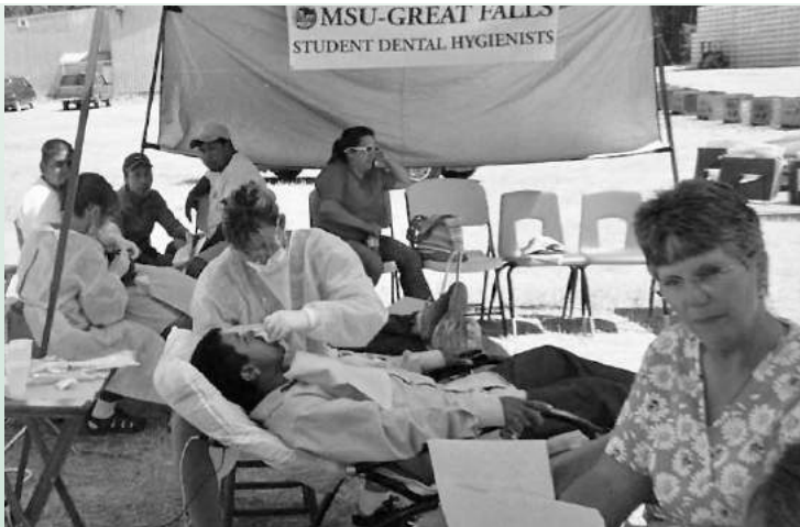
Montana State University dental students gain in-field, professional training by providing dental services to cherry harvesters in Western Montana.

Inside the unit, students conduct extractions, fillings, and sealings. Outside of the unit, they provide dental exams, hygienist screenings, cleanings, and health education. These services increase farmworkers' access to dental care as well as their likelihood