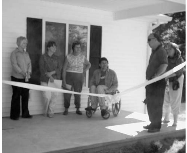
One of the patients of KMHA's Assertive Community Team celebrates getting a new home.

For all of these reasons and more, FHSI is pleased to share the following two innovative outreach practices from Outside In (Portland, Oregon) and the Kentucky Mountain Health Alliance (Hazard, Kentucky). We hope that farmworker-serving organizations like yours will learn from these practices and apply them to your own unique program.