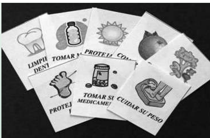
Raffle tickets with health messages used by Clinic Ole's outreach program to promote wellness among farmworkers.

Those who otherwise may not be willing to speak out during lectures are suddenly prompted to share their insights in a specific health topic once their ticket is drawn. Finally, this activity also serves to reinforce simple health concepts that empower farmworkers to foster a consciousness that enables them to take the steps needed to maintain a healthy mind, body, and spirit.