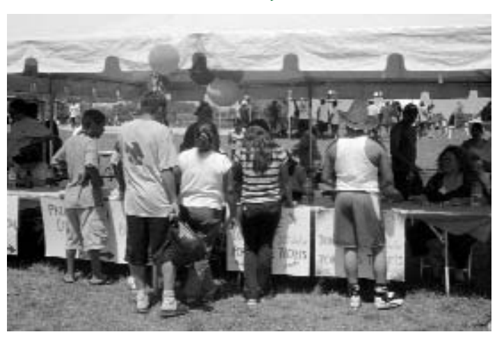
Farmworkers register at the annual Mid-Season Farmworker Appreciation Festival sponsored and coordinated by Southern Jersey Family Medical Centers, Inc.