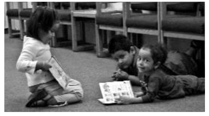
Farmworker children looking at books in the waiting room of Quincy Community Health Center as part of their Reach Out and Read® program.

parent's ability to read. This program helps children to improve motor skills by encouraging them to become more comfortable with holding and manipulating books. It also allows physicians and staff to assess whether or not an individual child's cognitive and motor skills are up to par. The ROR program provides health education messages through books with specific health themes (Vegetable Garden, Everyone Eats Rice, and the Cheerios Counting Book) and through the nutrition education sessions conducted during Darin's Eat and Read Club. Lastly, having parents involved in health education sessions with their children encourages the children to make smart nutritional choices in the future.