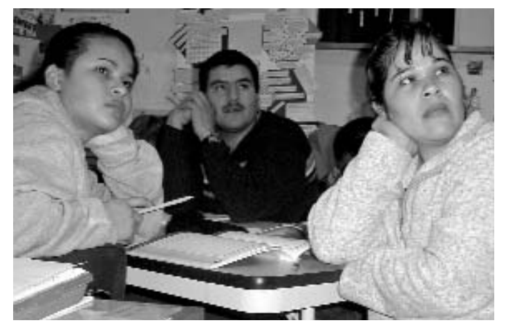
Farmworker parents attending Quincy Community Health Center-sponsored diabetes class during Bi National Health Week in Quincy, Washington.

Conducting a pre-season orientation with all health center staff is an effective tool for integrating outreach into the rest of the organization and clarifying the role of outreach in delivering health care services. Health center employees are now more aware of the purpose of outreach and the key outreach services provided to farmworkers. As a result, staff members have become more open to scheduling appointments requested by outreach workers when they call in from the outdoor camp clinics.