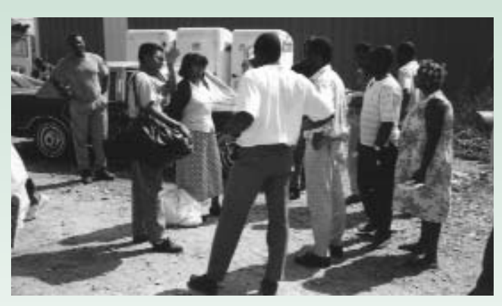
Westchester County AIDS agency representatives delivering HIV/AIDS education at a Haitian farmworker camp in Putnam County, NY (Hudson River HealthCare, Inc.)