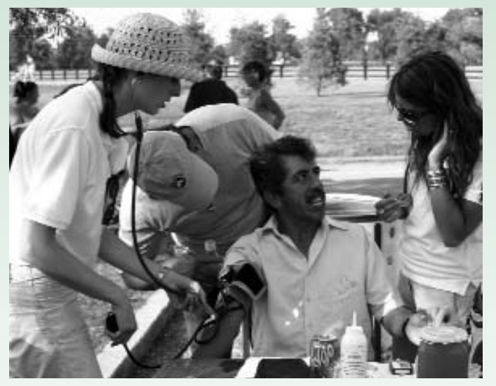
An Eastern Kentucky University nursing major checks this farmworker's blood pressure at a Bluegrass Farmworker Health Center community event in central Kentucky.

Two recipients were selected in 2005 for the Eastern Migrant Stream: Bluegrass Farmworker Health Center and Hudson River Health Care, Inc.