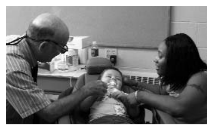
Screening dentist for Choptank Community Health System, Inc. examines the mouth of this preschooler, using an instrument he gave the child to hold earlier to get him accustomed to the equipment before the exam began.